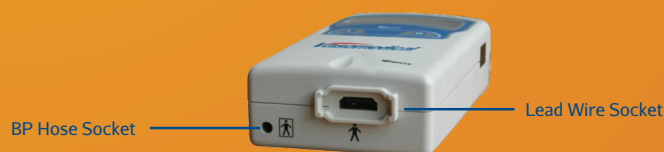
Vasomedical BIOX™ 2301/2302 Side View