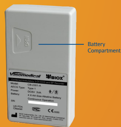
Vasomedical BIOX™ 2301/2302 Back View