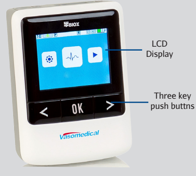
Vasomedical BIOX™ 2303/2304/2305/2306 Front View