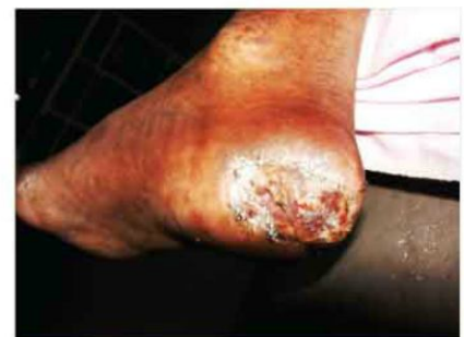
After EECP & Skin Graft

On the other hand, in cases where patients cannot have a major procedure due to uncontrolled infection or poor general condition, EECP is an alternative that should definitely be tried out to increase blood flow to the affected limb. It will probably open up a temporary window to initiate antibiotic therapy. It is also observed that in a few patients, diabetic neuropathy (tingling and numbness) has also improved, which is strongly believed to be due to better circulation happening in the smaller blood vessels. This could happen either because new small vessels are developing due to the EECP, or because the peripheral resistance of blood vessels drops when the patient is under EECP. EECP improves blood circulation, gives better muscle tone and improves nerve conduction in patients with vascular problems in foot and hence helps in limb salvage.